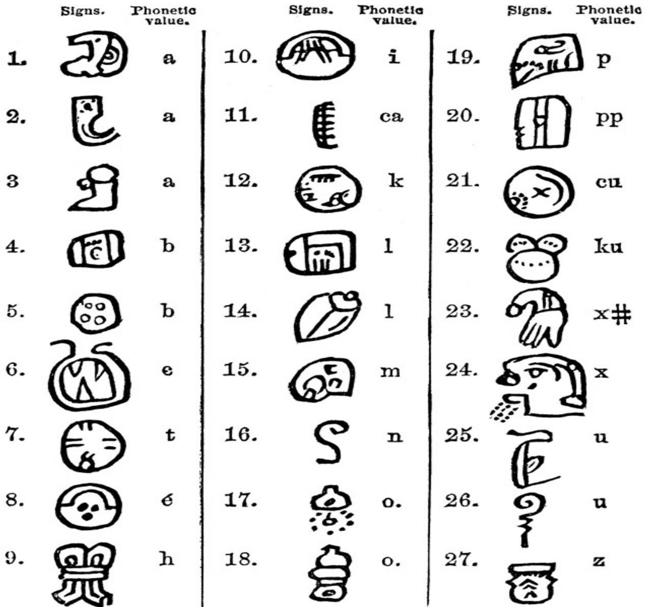
DIEGO DE LANDA'S MAYA ALPHABET.