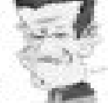
5. DENZEL - ACTOR