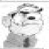
6. LUKE - PRESIDENT - 1980