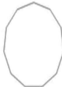
Hendecagon – 11