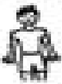
fat or thin / slim