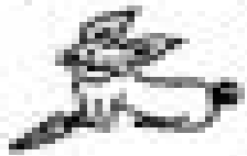
slow or fast