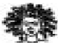
beautiful or ugly