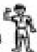
strong or weak