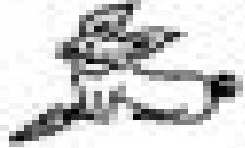
slow or fast