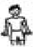
fat or thin / slim