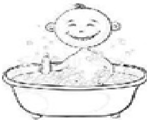
Having a bath