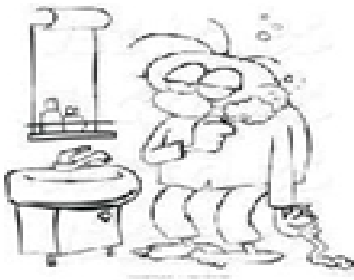
Brushing the teeth

1. What uses most water? Underline the top 3! (3X1 point)