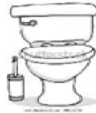
Flushing the toilet