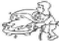
Caroline lave la voiture. Caroline washes the car

French uses reflexive pronoun to express the idea of "myself, yourself, himself, etc". Verbs describing daily personal routines frequently require the reflexive pronoun. However some verbs can be used both with reflexive pronouns and without. Note the examples below and then complete the activities.