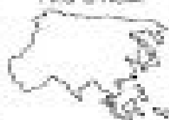
This is Asia.

Asia is the second largest continent. There are 48 countries in Asia. It is in the northern hemisphere.