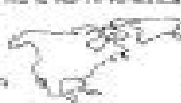
This is North America.

North America is the second largest continent. There are 23 countries in North America. It is in the northern hemisphere.