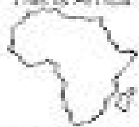
This is Africa.

Africa is the largest continent. There are 54 countries in Africa. It is 14,000,000 square kilometers.