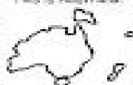
This is Australia.

Australia is the continent in the southern hemisphere. It is the only continent in the southern hemisphere.