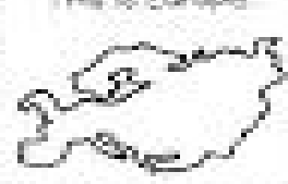
This is Europe.

Europe is the second smallest continent. There are 49 countries in Europe. It is in the northern hemisphere.