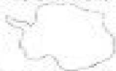
This is Antarctica.

Antarctica is the southernmost continent. It is the coldest and driest continent. It is in the southern hemisphere.