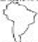
This is South America.

South America is the largest continent. There are 12 countries in South America. It is in the southern hemisphere.