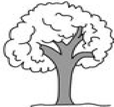
LEAVES FROM TREE

For more printables visit www.bravekidgames.com BRAVE KID GAMES, brain-teasing, non-violent fun for kids