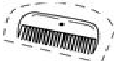
MANE & TAIL COMB