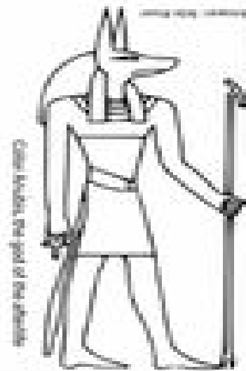
Osiris, the god of the dead