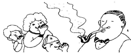
My father sometimes smokes a pipe. It smells awful!

I work from 9 to 5. You work very hard. She works in the supermarket on Saturday. He works for my father in our office. We work for the new company in the centre of town. They work in uniform. She enjoys English classes. He's a student, he reads a lot.