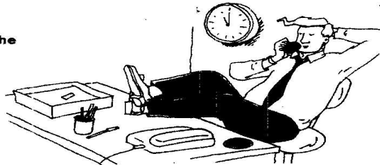
He stops and has a cup of coffee at eleven o'clock.

They have everything you want in that shop. She has a house in St James' Square.