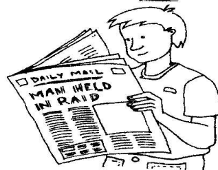
I read the newspaper every day.

We often go to the cinema on Fridays. My parents never eat meat. I get up late at the weekend.