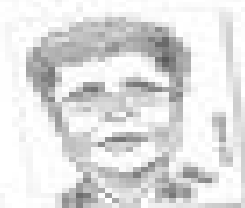
2. BRAD PITT - ACTOR