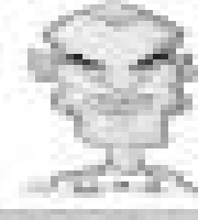
10. DENNIS - RODMAN - BASKETBALL - PLAYER