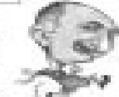
7. TOM BRADY - FOOTBALL - PLAYER