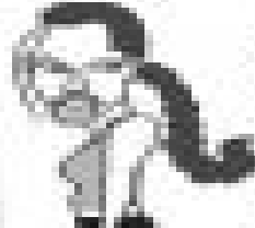
3. ANGELINA JOLIE - ACTRESS