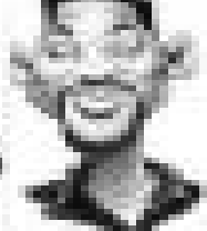
4. WILL SMITH - ACTOR AND - RAPPER