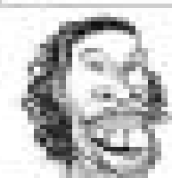
8. KOBE BRYANT - BASKETBALL - PLAYER