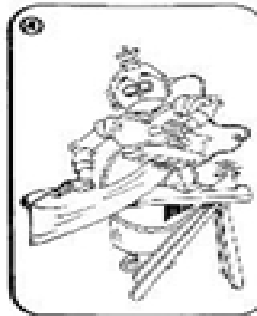
4) The robot carries the clothes.