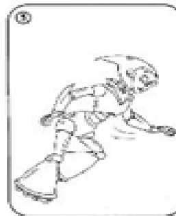
5) The robot swims.