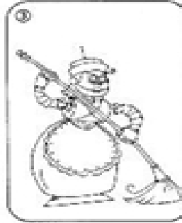
3) The robot sweeps the floor.