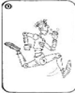
1) The robot runs.

Match the pictures with the sentences below