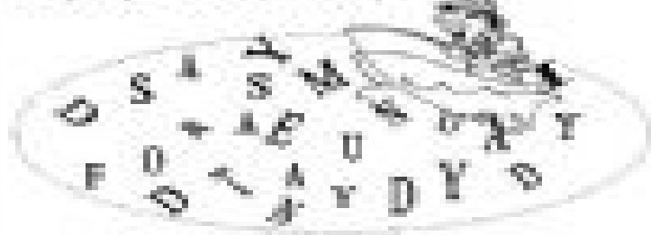
Table. Find the answer to the crossword.

Can you help the children to find the day?