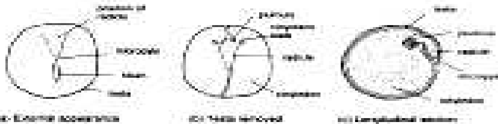
Structure of pea seed