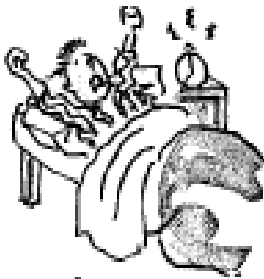
I wake up