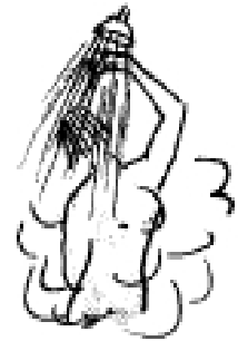
have a shower