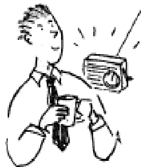
listen to the radio