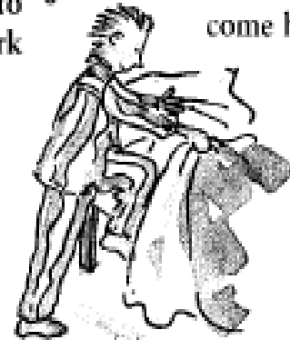
go to bed