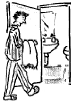
go to the bathroom