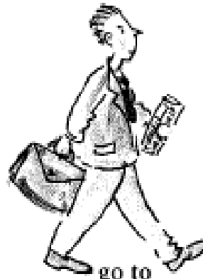
go to work