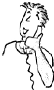
phone (or call) a friend