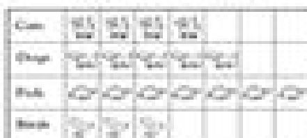
Pets on Redwood Road

On Redwood Road, are there more cats or dogs?