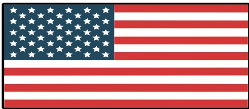
The Current American Flag

The U.S. flag has undergone many changes since the first original flag was erected in 1777. Before the official flag was chosen, there were many different flags that were popular in different colonies. The exact origin of the first American flag is unknown, but many historians believe that a New Jersey Congressman named Francis Hopkinson, designed the flag