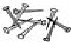
Steel nails and copper nails

On the left, you can see four mixtures. On the right are four different methods for separating mixtures. Draw a line between each mixture and the best separation method. On a separate piece of paper, explain your choice.