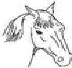
Ears pointed left and right relaxed, paying attention to the scenery on both sides