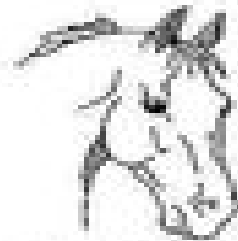
Ears pointed stiffly forward alarmed or nervous about what's ahead. Looking out for danger