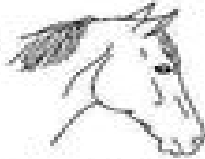
Ears forward but relaxed interested in what's in front of him

The horse's ears and actions are the key to his emotions. He can tell you what he is paying attention to and how he feels by the way he uses his ears and the way he acts. Following are some tips to his emotions.