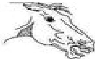
Ears flattened against neck violently angry, in a fighting mood Play fight, bite or kick