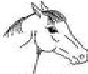
Ears wiggly back annoyed or excited about what's behind him; might kick if annoyed