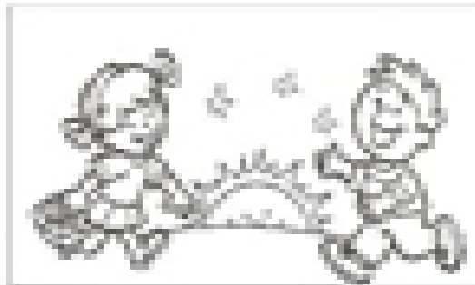
WORD 2: _____