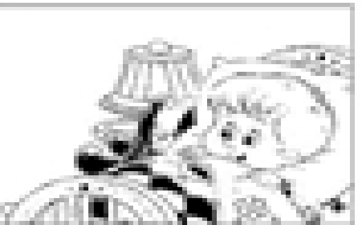
WORD 4: _____