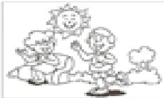
WORD 1: _____