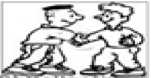
WORD 5: _____